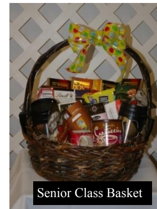
Senior Class Basket