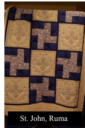
St. John, Ruma